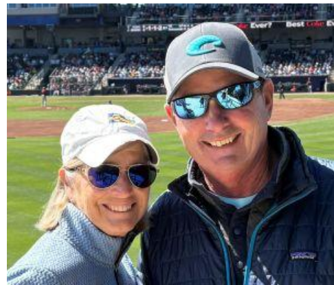
Sheboygan's Port Captain has half-century of experience

THE SEASON IS NOW: June brings us to the heart of the Great Lakes boating season, when long-awaited cruise plans are finally under way and our harbors, docks, and anchorages come alive with GLCC events. It is a special time for all of us who treasure life on the Great Lakes. This is the season that reminds us why the Great Lakes continue to hold such a special place in our hearts, whether your summer plans include